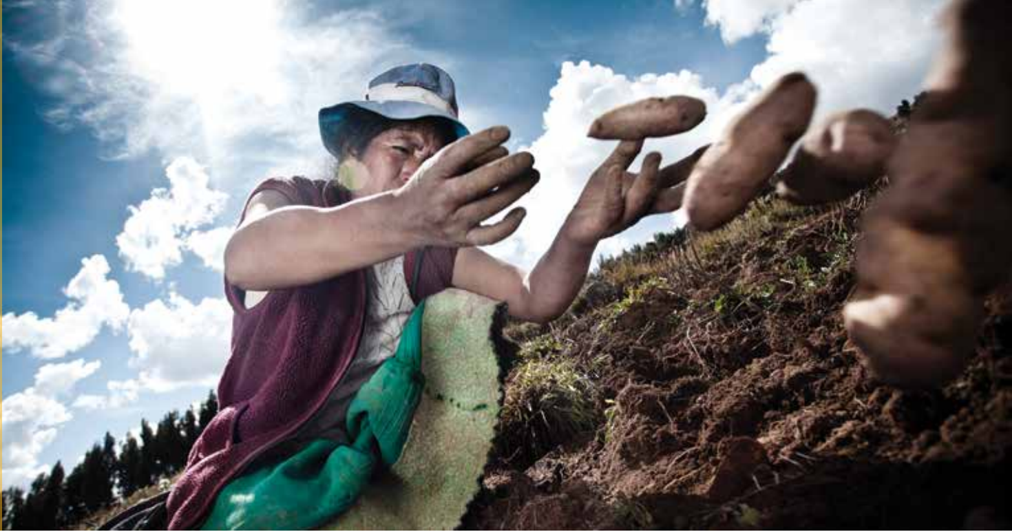
A woman harvests potatoes in the mountains high above Shullcas River in Peru's Central Andes. CARE has been working with communities to overcome variations in sources of water, as glacial melt and increasingly unpredictable weather conditions take hold.