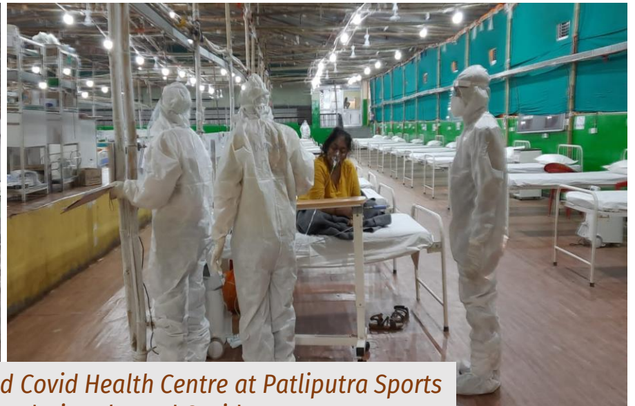
CARE Team at the Dedicated Covid Health Centre at Patliputra Sports Complex Patna during the 2nd Covid wave