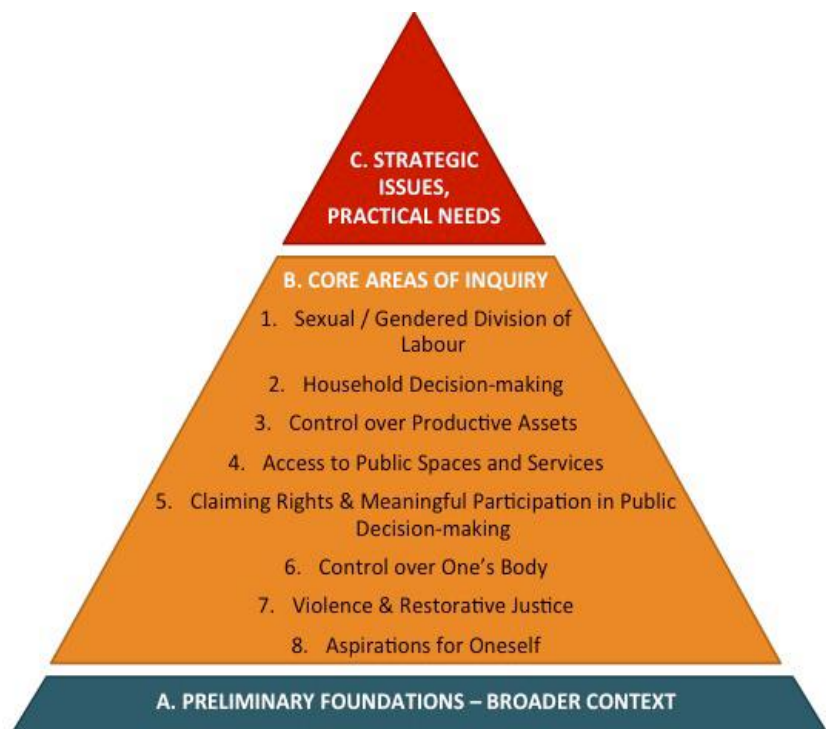
CARE's Good Practices Framework

Particular attention was paid to discussing the intersectionality of gender with other diversities that this intervention is addressing. Therefore, the aspects of age, disability, ethnicity (minorities) and urban/rural locations have been included into the equation when deciding about the content of the final tools as well as the skills and standards required for the data collection (principles of do no harm, inclusivity, and ethical issues). Since not all of the partners are expected to implement the same type of activities nor are they targeting the same type of audiences, not all of them necessarily considered the same lines of inquiry. Hence, partners adapted their selection of areas of inquiry to best correspond to their audiences and areas of activity (for example, five partners specialize in elderly care and so included a line of inquiry which focused on relevant services such as home care visits to the elderly).