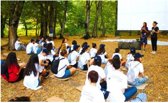
NNLE SAGA - Ocho camp Social cinema