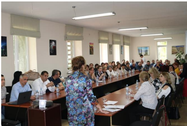
Official launch of LAG independent project, 25.05.2019, Administration building of the Lagodekhi protected area

In September 2019, PR group of Mercy Corps visited Lagodekhi and took a video regarding LEADER models advantages, LAG achievements and successful initiatives, accessible at: https://youtu.be/gzwsUO8LcII