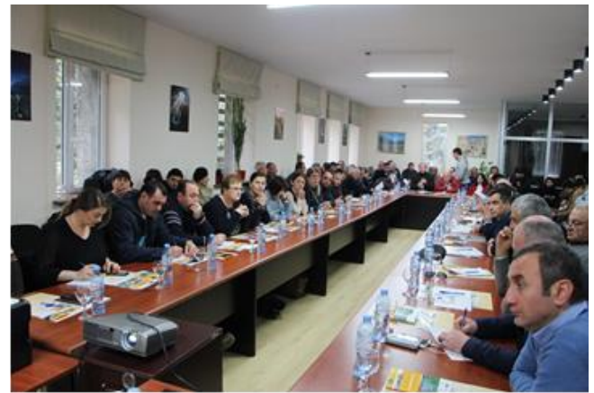
LAG General Assembly meeting, 13.02.2018, Administration building of Lagodekhi protected area