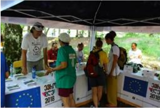
EU day in Lagodekhi. 05.05.2018

To facilitate information exchange and improved communication with beneficiaries the project supported the operation of the LAG websites and Facebook page that made the project more accessible and transparent.