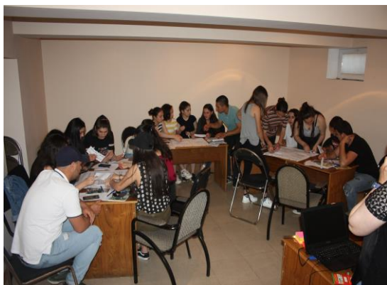
Youth working group discussion under sub grant “Youth needs assessment”. 12.03.2019, Lagodekhi

Five thematic groups are operational in the LAG: Tourism, Social, Agriculture, Environment and Infrastructure. Members of these groups work to identify the problems and needs existing in each of these sectors and advocate to the relevant institutions to take appropriate measures addressing the needs identified. LAG Board of Directors is composed of 15 persons elected from the General Assembly, 5 from each thematic sector.