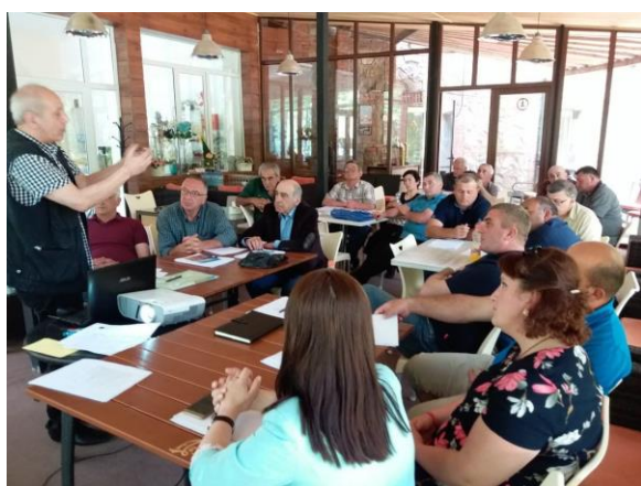
Sub grant applicants training in business planning. 09.08.2018, Administration building of the Lagodekhi protected area

The final version of the strategy document was presented and approved by the General Assembly and uploaded on LAG's web page, accessible at: https://lagodekhillag.ge/ge/23