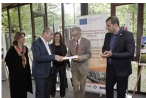
EP visit in Lagodekhi, 02.10.2019, ENPARD Terrace

LAG members from Czech Republic visited Lagodekhi in August 2019, to discuss the potential cooperation between Lagodekhi and Czech LAGs, particularly in the winemaking business and tourism sector. As a EU member state, Czech partners agreed to do fundraising for the joint project together with Lagodekhi LAG in the near future.