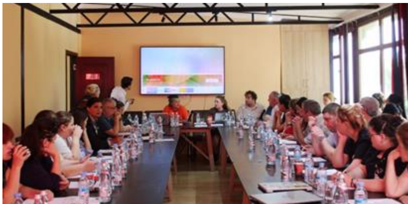
ENPARD implementing agencies and GALAG joint workshop. 18.07.2019, Shekvetili, Georgia

ELARD's representatives together with other project partners attended the 21st ENPARD Stakeholder Committee on 10 June 2019 in Tbilisi. During the meeting, ELARD representatives gave a brief overview about ELARD's and GALAG's main achievements in the ongoing project.