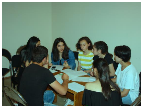
Youth working group discussion under sub grant “Youth needs assessment”. 15.03.2019, Lagodekhi