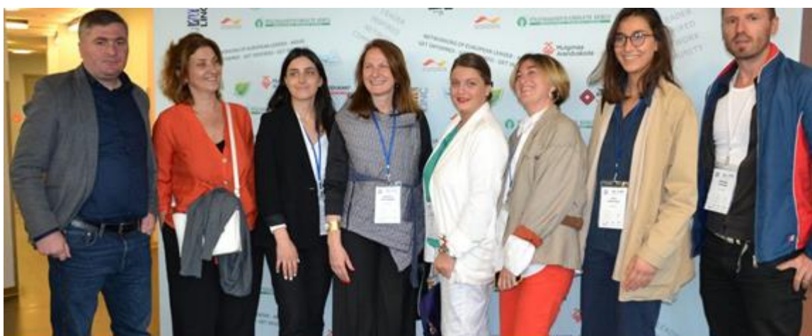
LINC conference. 12.09.2019, Parnu, Estonia

On 10 -12 September 2019, representatives from Mercy Corps, CARE and PIN projects, as well as Borjomi, Lagodekhi and Kazbegi Local Action Groups (LAGs) participated in Leader Inspired Network Community - LINC Conference in Parnu, Estonia. In the framework of the conference organized a cooperation corner for the participants to discuss and develop project ideas for future cooperation. The event participants had an opportunity to participate in sports activities and interactive games, to visit the projects in rural areas implemented by local action groups and share best practices of rural development in Estonia.