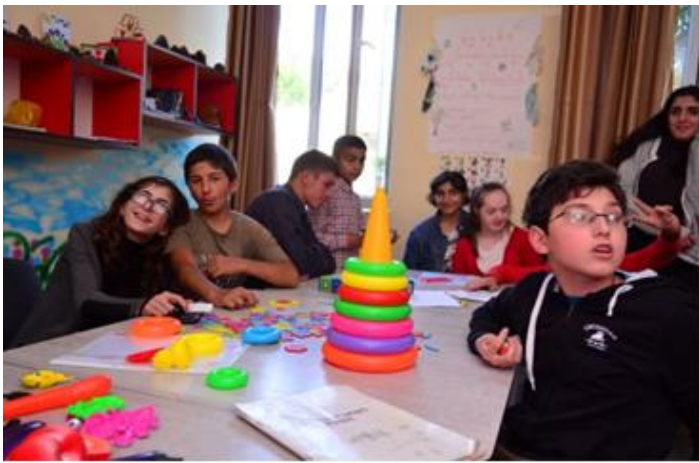
NNLE "Madli" – Psycho rehabilitation center for children with disabilities