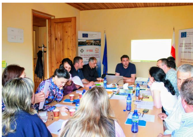
Meeting with the LAG board of directors. 03.12.2018, CARE office in Lagodekhi

Support for professionalism was also given through technical support to the LAG to improve proposal writing skills in order to develop qualitative proposals for submission to local as well as international donor organizations. As a result, the LAG gender thematic group implemented the independent project funded by the Women Fund of Georgia „Women needs assessment and integration of ethnic minorities in elaborating of proper gender policy and action plan in Lagodekhi” and a transnational project with the Latvian LAG “Horse industry, possibilities today and in future”.