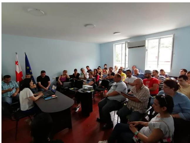
Cross visit of Lagodekhi, Borjomi, Khulo and Keda LAGs, 18-19 July, 2019, Keda Municipality

In order to establish strong communication and networking with other LAGs implementing ENPARD rural development projects in Georgia, CARE facilitated cross visits between the LAG members during the project cycle. In this way an exchange of knowledge and experience about development practices from different regions was facilitated.