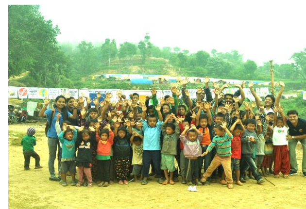
Global hand washing day celebration in IDP camp, Dhading.