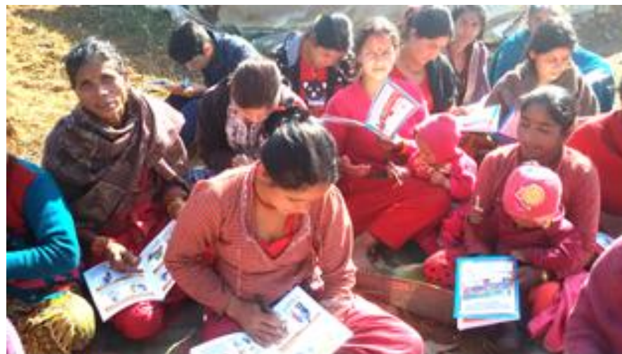
Awareness programs on GBV, human trafficking, child marriage, sexual violence, referral services for GBV survivors at Sindhupalchok