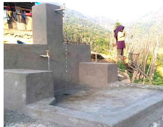
Women and children friendly community tap in Gorkha.