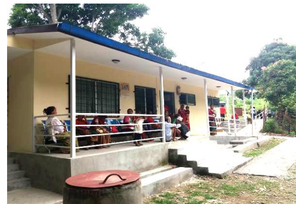
Prefab Health post building at Gankhu, Gorkha