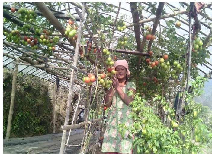
Tomato in plastic tunnel, Phulkharka, Dhading