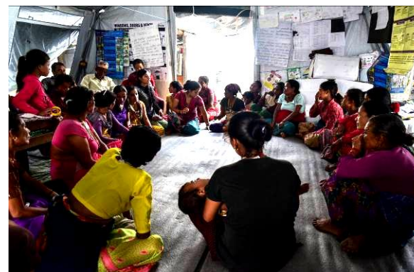
Women discussion on female friendly space at Sindhupalchok