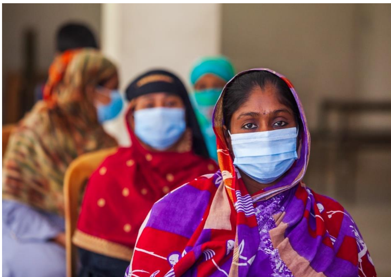
A participant at the community meeting, Keraniganj, 05.11.2020