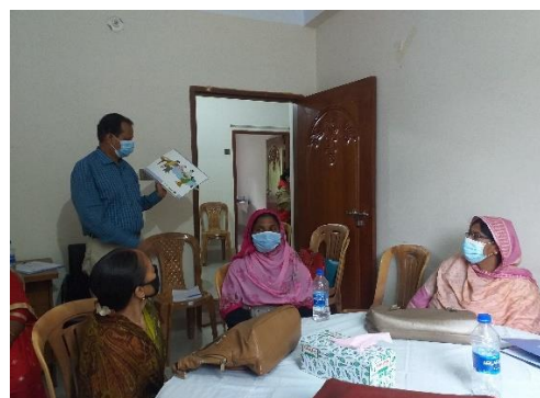
Caption: Information Champions are being briefed about migration related laws and CBO formation at Nawabganj