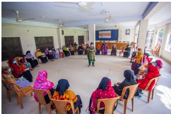
Caption: Participants at the community meeting, Keraniganj, 05.11.20