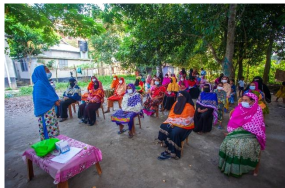
Caption: Participants at the community meeting, Nawabganj, 05.11.20

During the reporting period, the guidelines for community meetings were developed and finalized. A total of 7 community meetings were held, covering 242 participants (188 female, 54 male). The center-in charge provided all information to the participants, related to the project, safe and regular migration, gender based violence, etc.. Participants were provided with referral contacts including the project’s trained information champions and UDC entrepreneurs at the established migration corners of the UDCs, as well as the Migrant Resource Centre (MRC) in Dhaka.