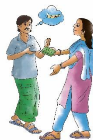
Illustrations: Some sample illustrations that will be used for the Court Yard meeting Flipchart

A pocket booklet in Bangla for beneficiaries that includes guidance on life skills and overall migration process will be developed and distributed to potential women migrants after the life-skill based pre-decision training and through DEMO (activity is linked to Output 3). A one-pager summarizing the project objective and activities for advocacy purposes was drafted in English and shared with ICMPD with the first interim report. It is planned that the one-pager (in English and Bangla) will be printed in December 2020 and shared among stakeholders.