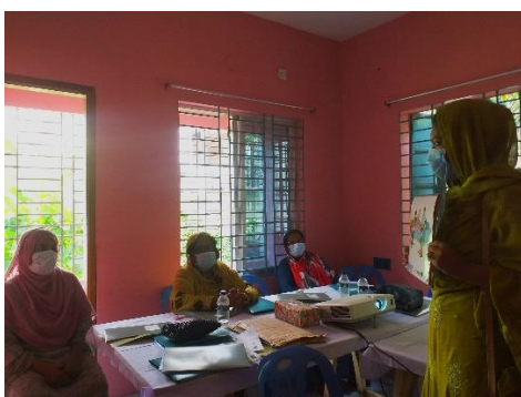
Caption: A participant is volunteering at women information champions' training at Keraniganj