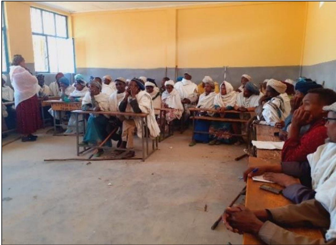
Partial view of IGA-SPM training participants from Este woreda, Apr 2023.