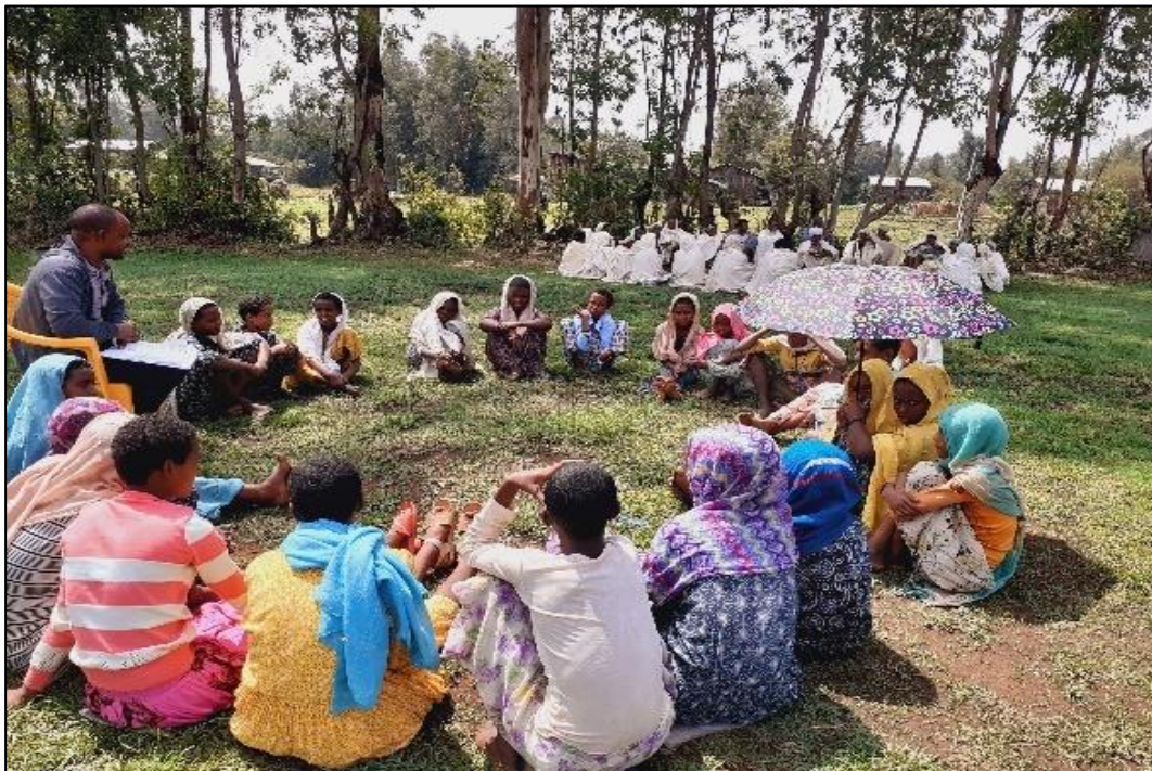
Girls' group visit, Este Woreda, July 2023