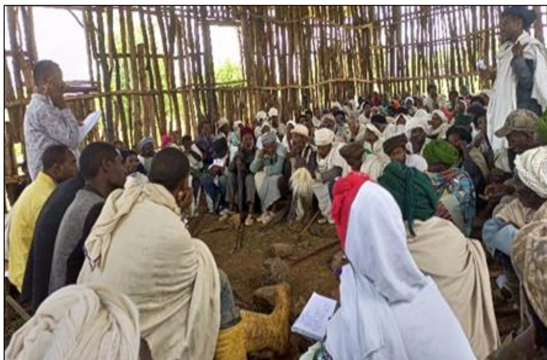
Partial view; SAA members discussion & role model selection, July 2023, Fogera Woreda