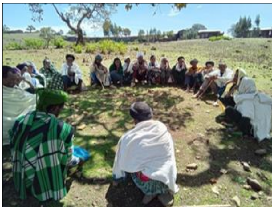
Early adopter from SAA/VSLA group of Fogera woreda, Tiwaza kana kebele.