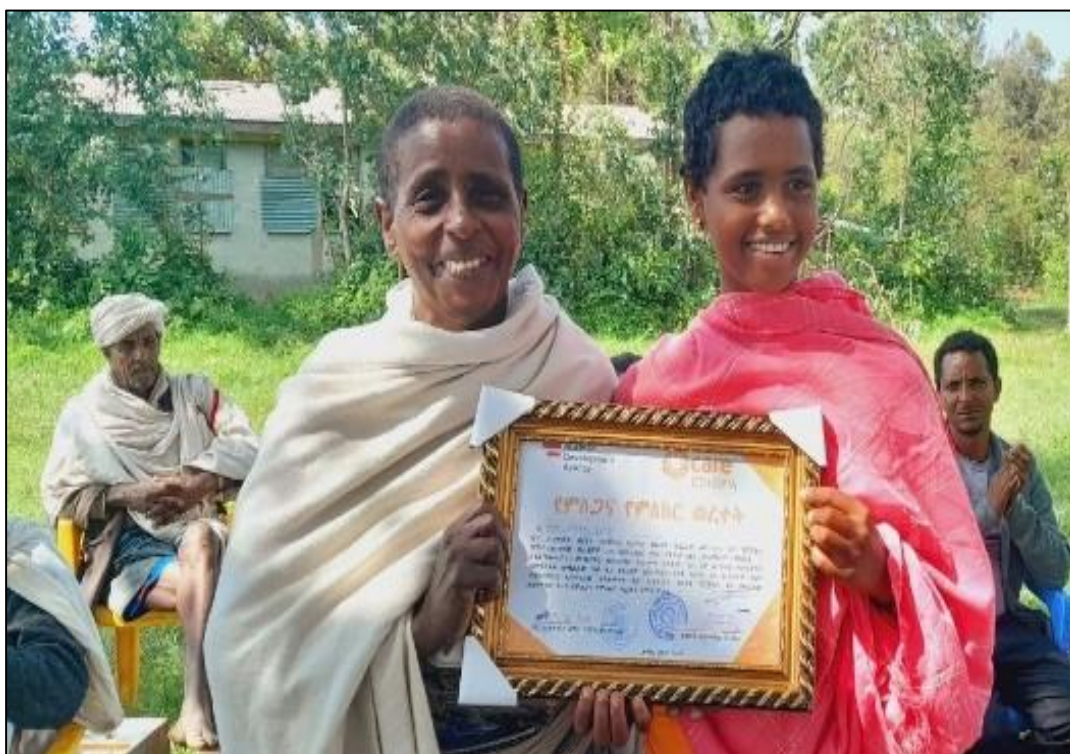
Girl's role model certified during recognition event at Fogera woreda, July 2023.