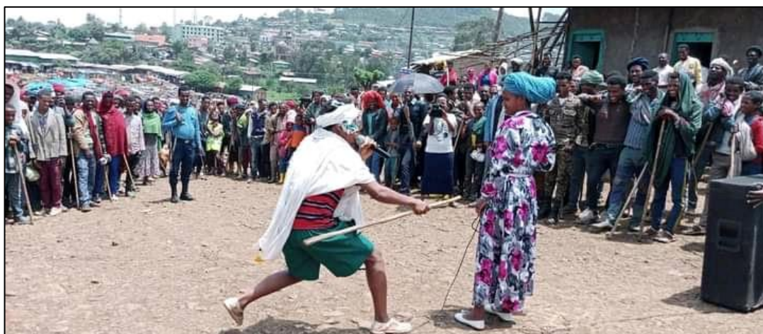
Market square event, Este Woreda