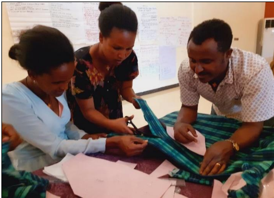
Local sanitary pad production training for new school teachers, on May 2023