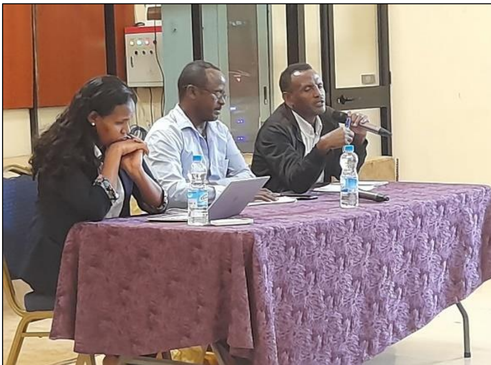
Partial view, meeting chair remarks.