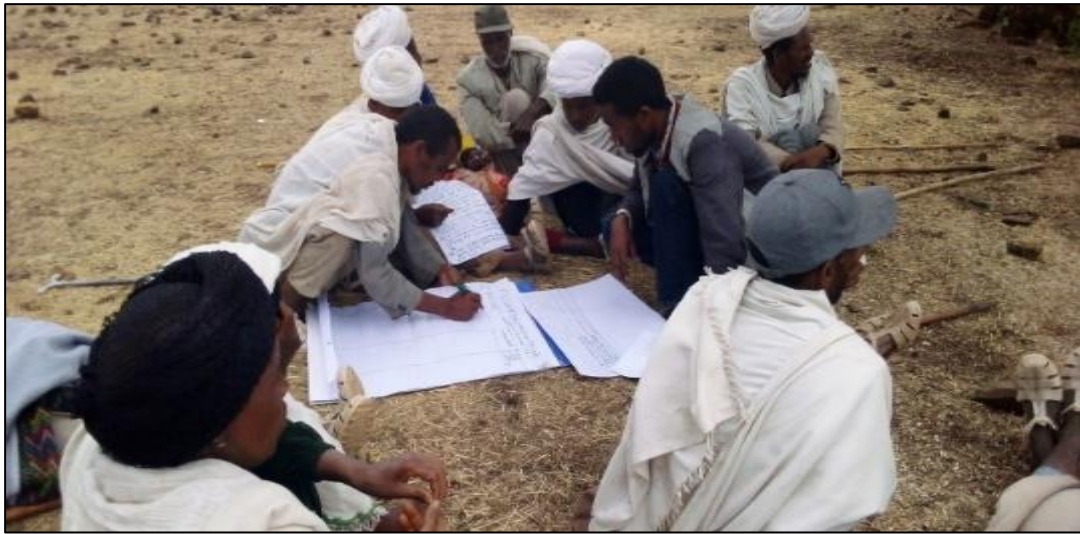
Partial View, action plan development, during CSC interface meeting, with service providers and community members at Deberesalam, Este Woreda