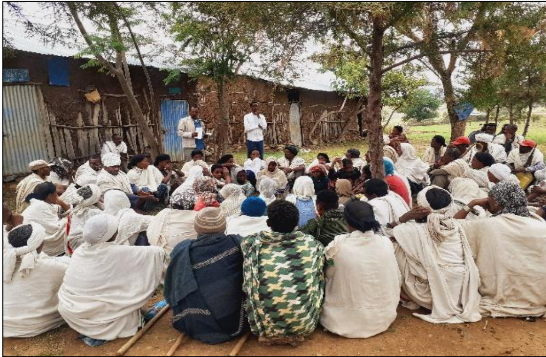
Community Orientation sessions with kebele participants