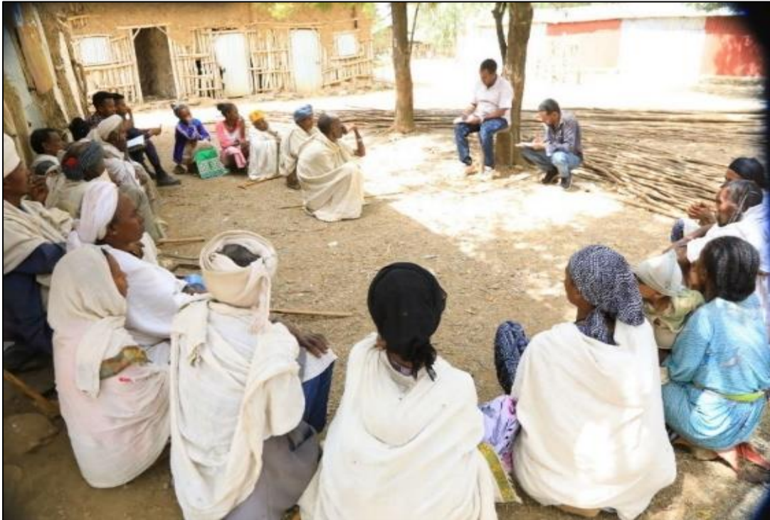
Zone and Woreda Experts held discussion with SAA/VSLA groups, Fogera Woreda, Mar 2023.