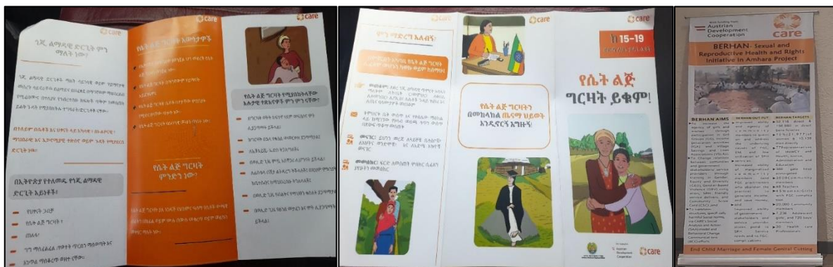
Prepared IEC/BCC materials, and learning docu