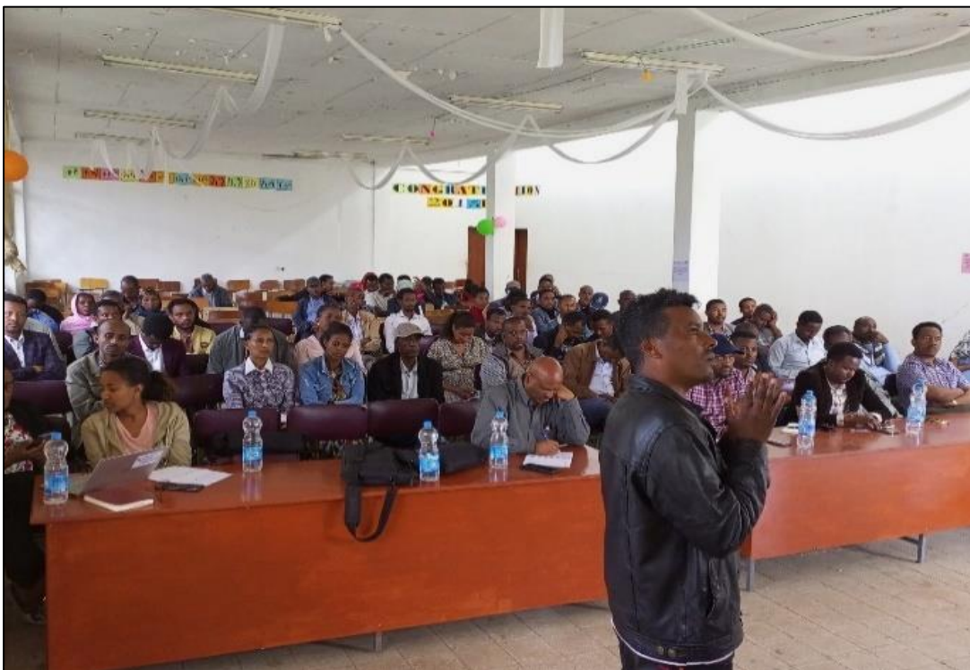
Supportive supervision feedback reflection and discussion, July 2023.