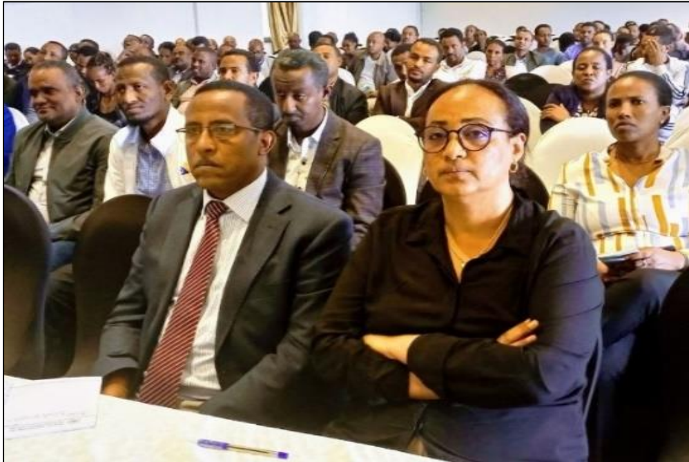
Partial view, Anti HTP conference participants at Bahir Dar, May 21, 2023