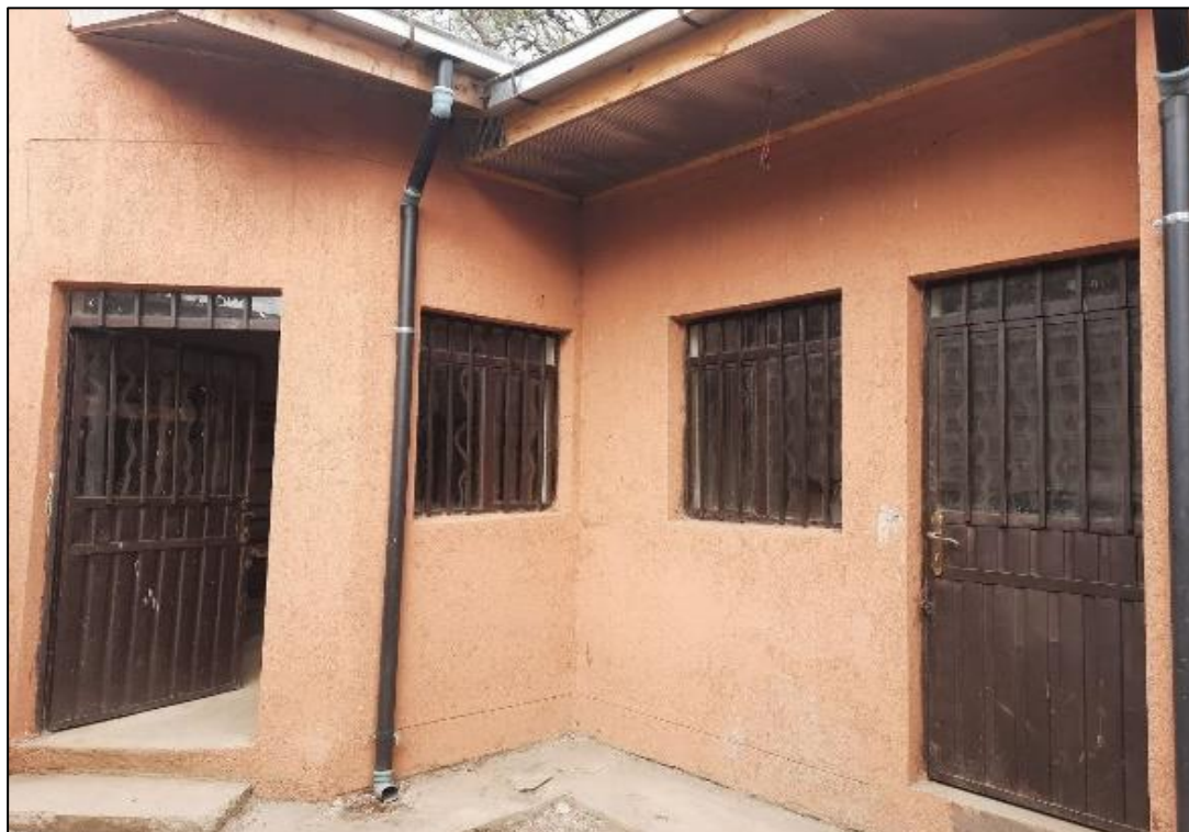
View of Constructed GBV shelter, Nov 2023.