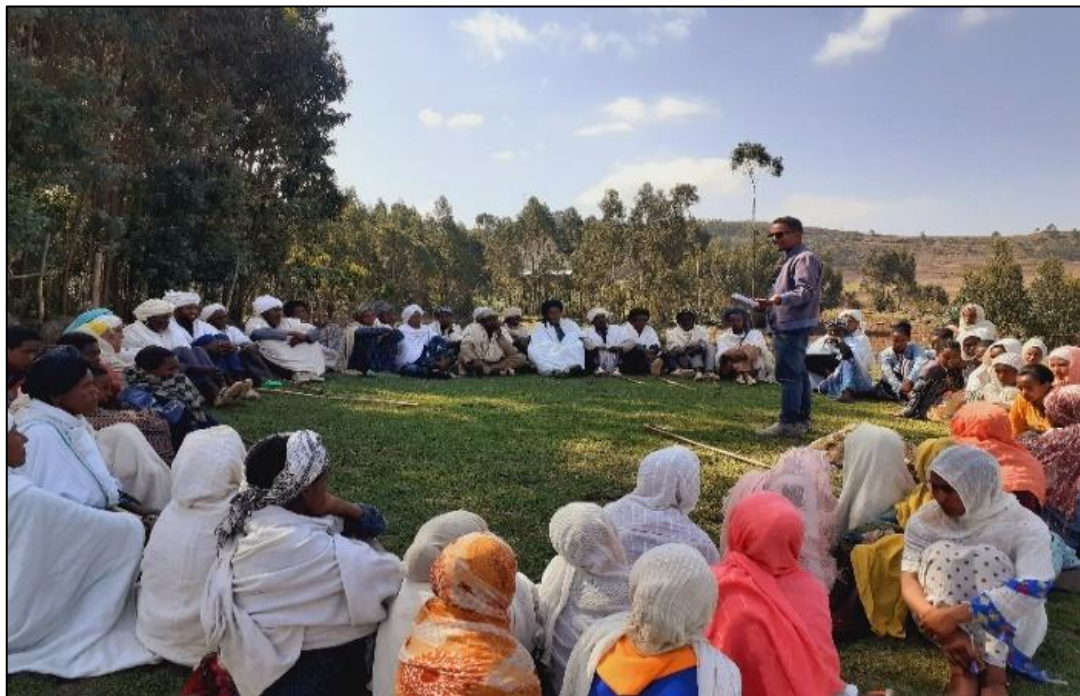
Public debate at Shina kebele, Fogera woreda, Jun 2023.