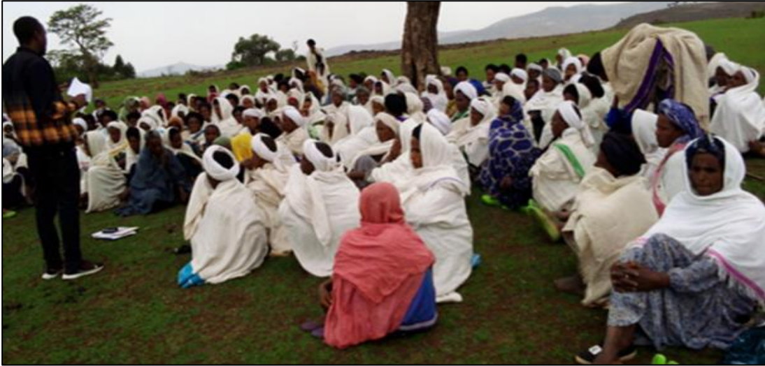
Parent-debating session at Debreselam kebele, Este woreda, Apr 2023.