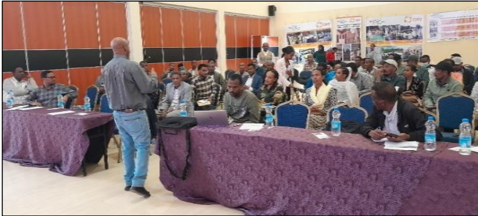
Final exit meeting participants partial view, Feb 2024, Bahir Dar