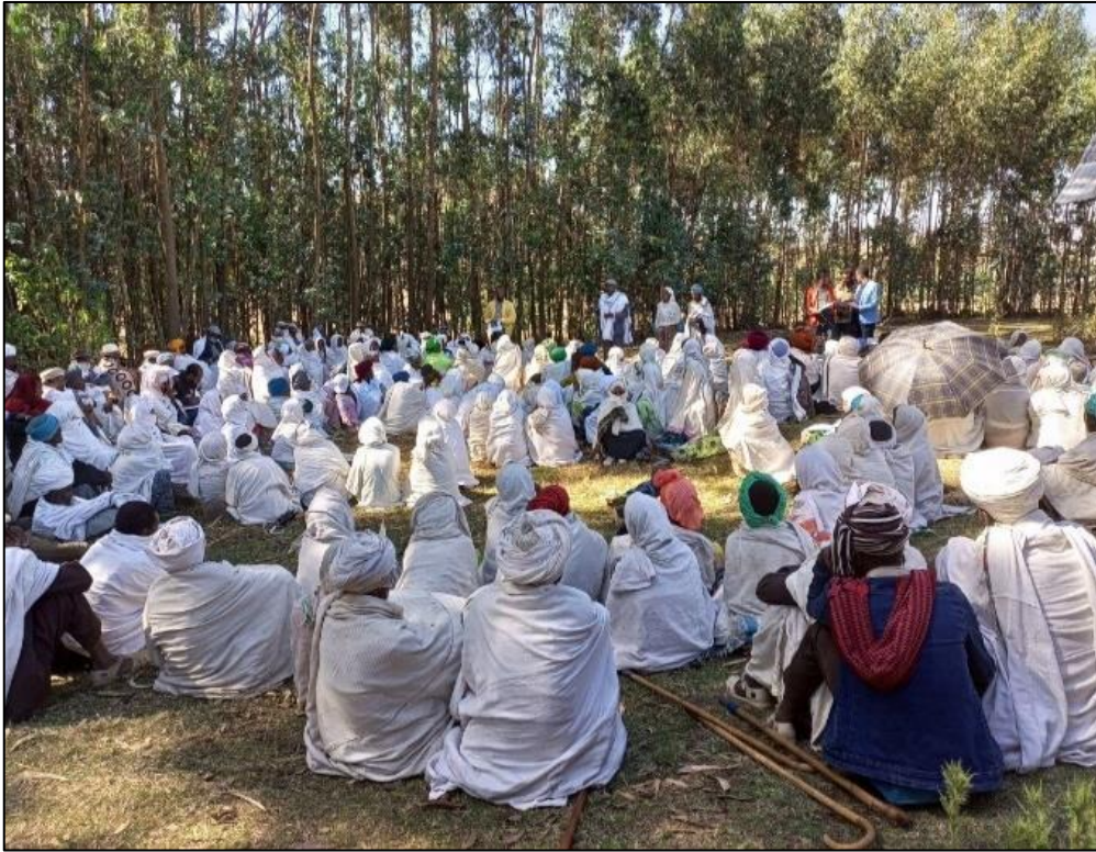
Public debate discussion at Dengolt kebele, in Estie Woreda, Mar 2023