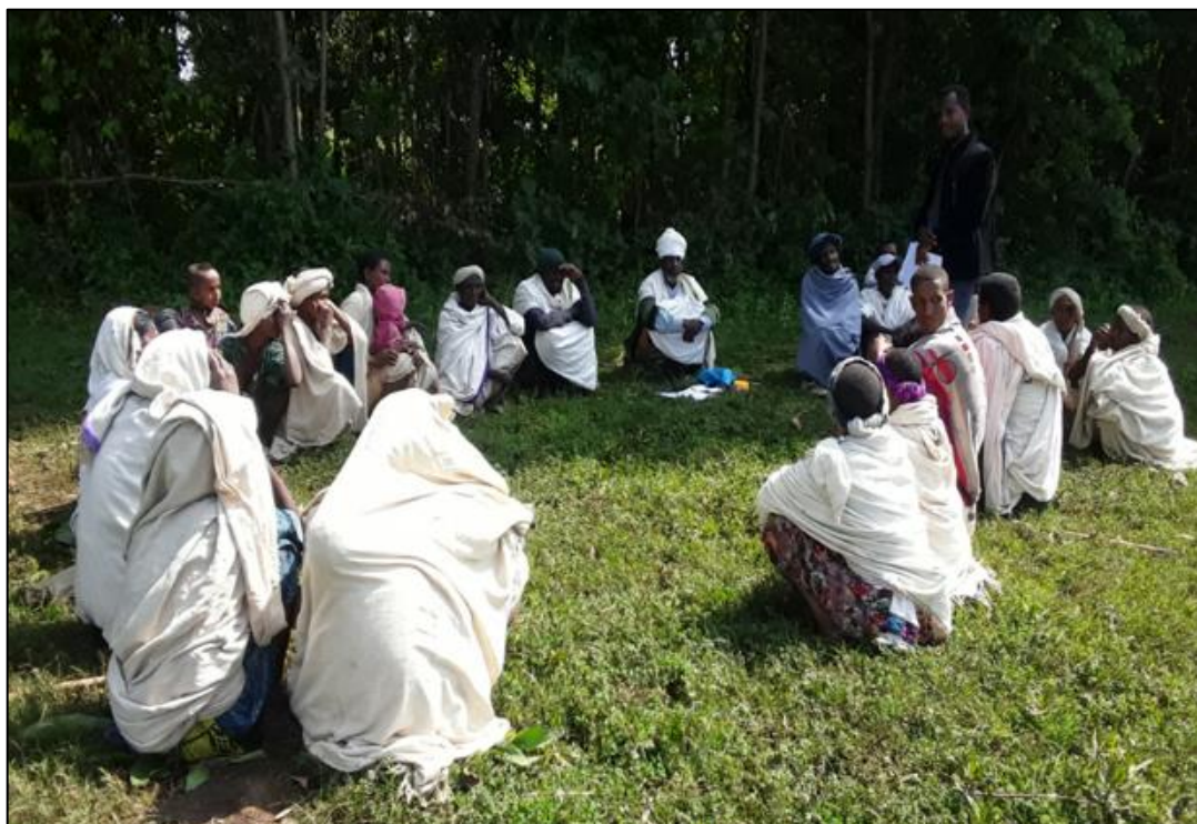
SAA facilitators monthly review meeting, Este Woreda, July 2023