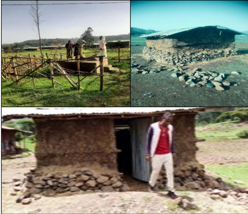
CSC results; rehabilitated water point (top left), maintained health post (top right), communal latrine (down)