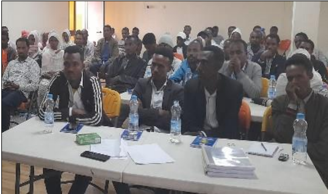
Participants training at Debre Tabor on May 13-15, 2023