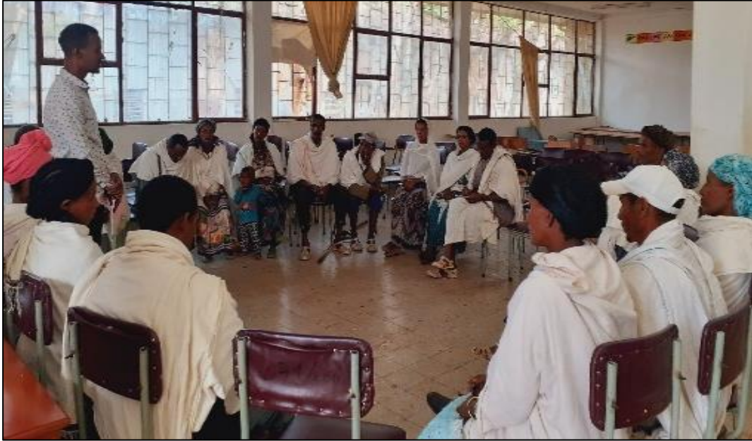
SAA cascading training for SAA facilitators