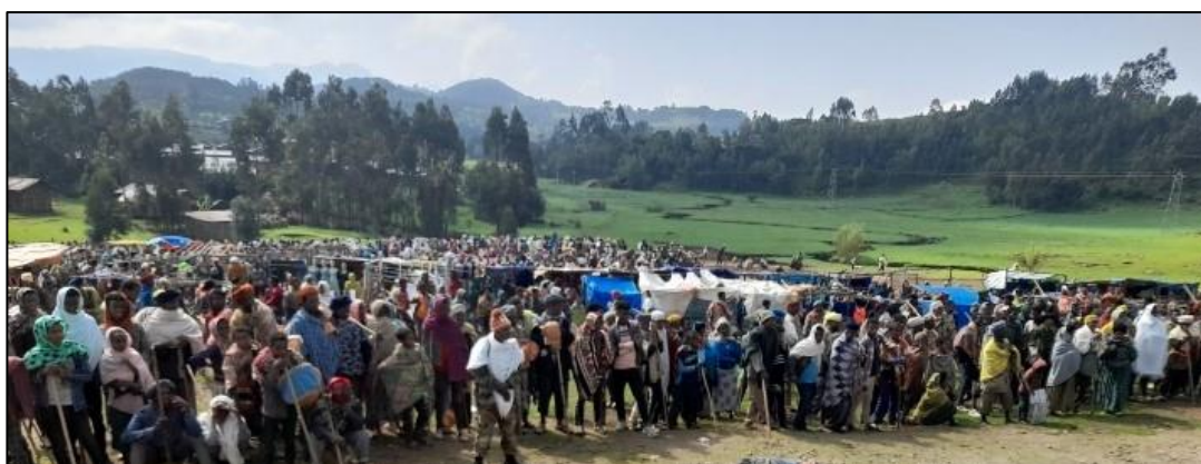
Market square event at Lewaye marketplace, Este woreda,2023.