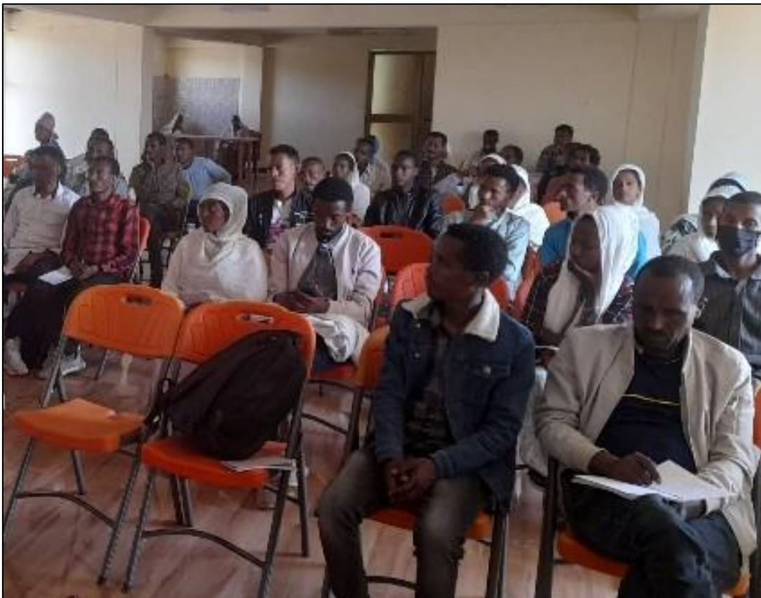
Refresher training participants, May 2023 at Debretabor.