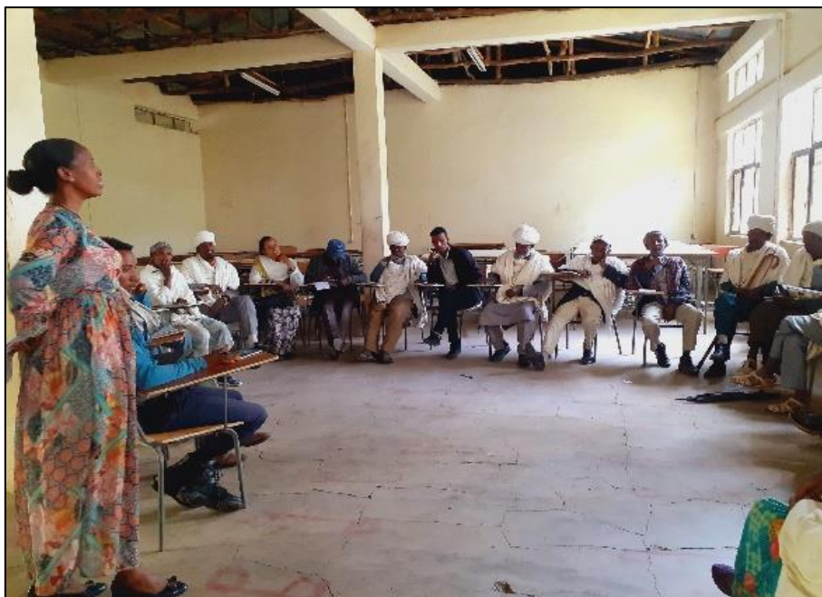
SAA Core group facilitators training Fogera woreda, June 2023