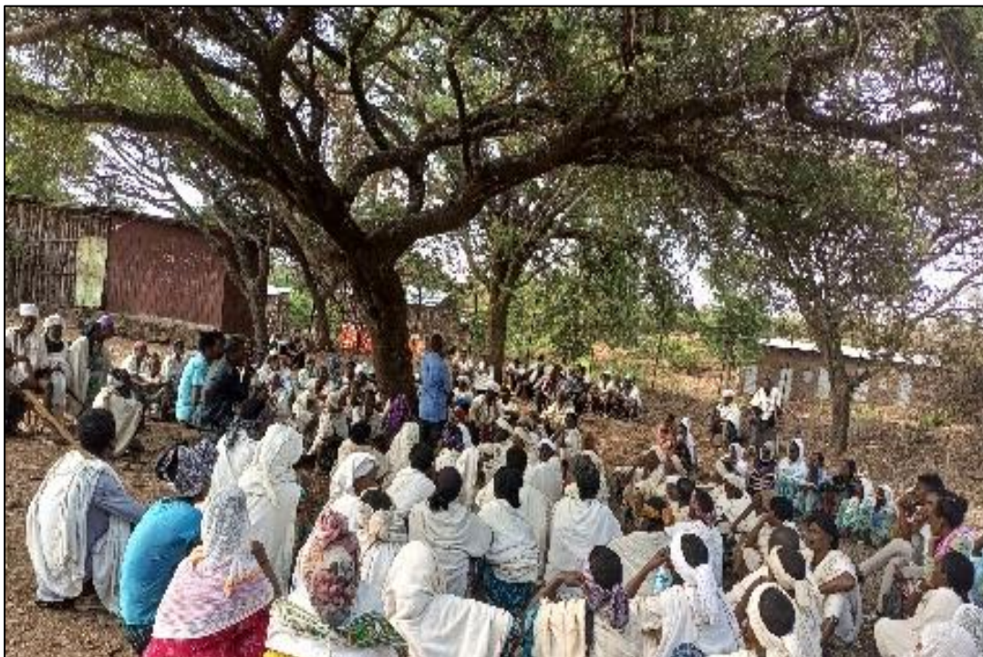
SAA - CSC integration meeting at Tiwaza kana kebele, Fogera woreda, May 2023.